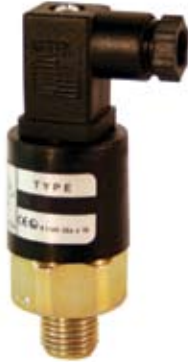
Execution with electric connection M2