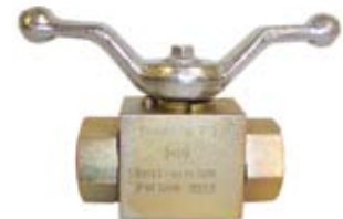
ON REQUEST - WITH WING LEVER